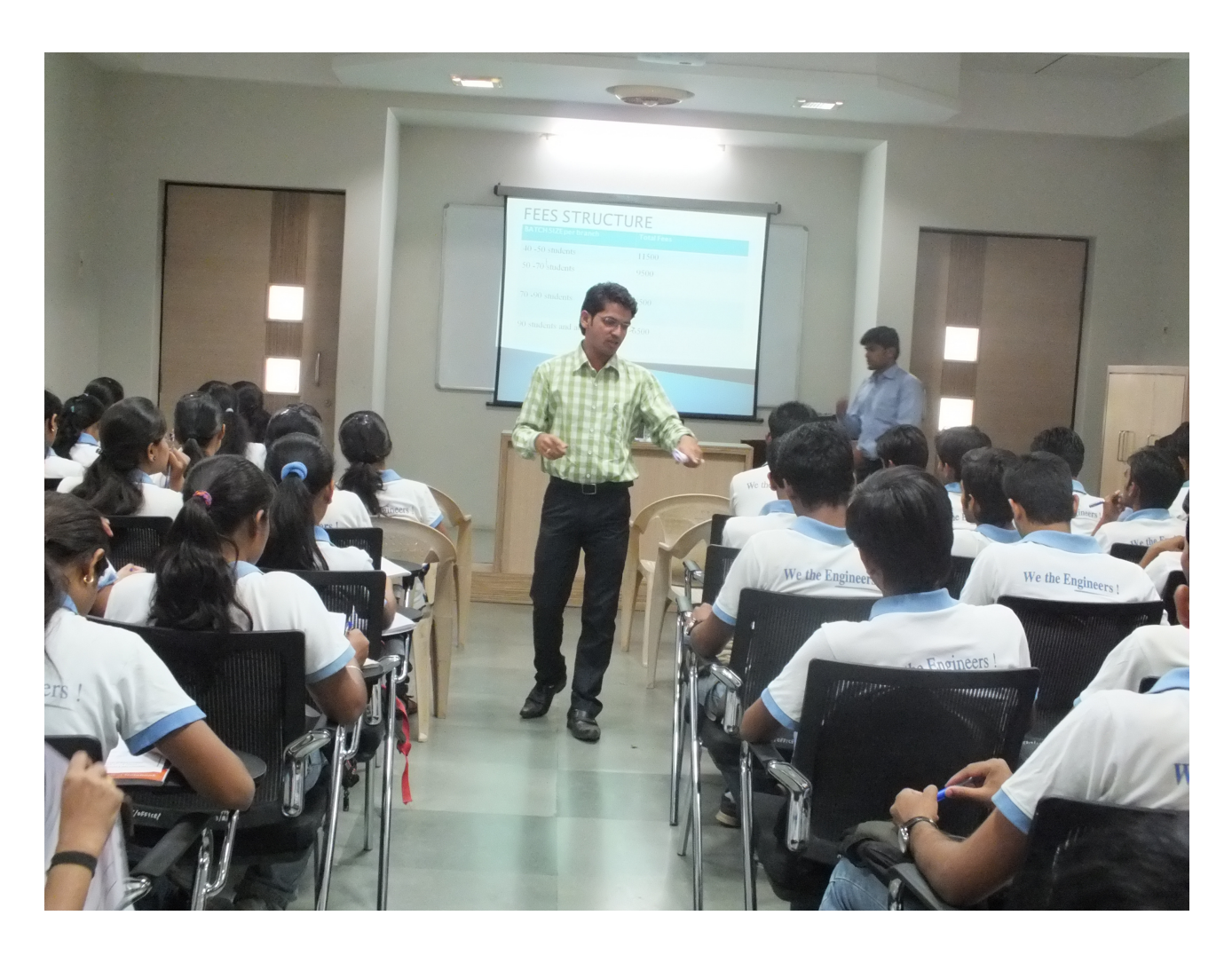
Expert guiding students on Opportunities after GATE

This seminar was conducted by Imperial Institute of Excellence, Pune for third year of students of all streams in RCPIT campus. Their major focus was on Career Opportunities for engineering graduate after successful GATE score. They motivated & guided students on job opportunities in Government & PSU sector after GATE score. This seminar was held on 7<sup>th</sup> April 2014 in RCPIT campus. There were around 250 students from third year (2014-15) have been participate in this seminar.