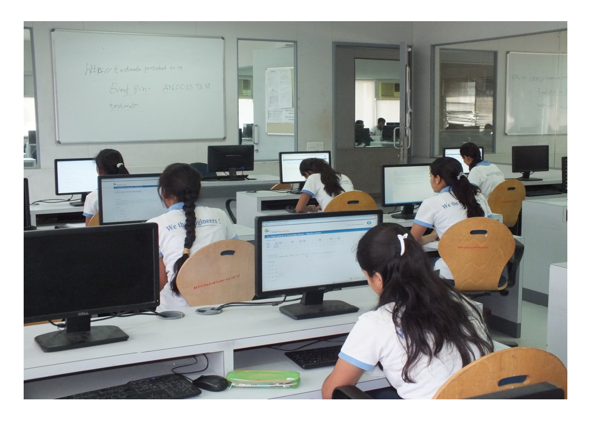
Students during their Persistent BE Project Online Test