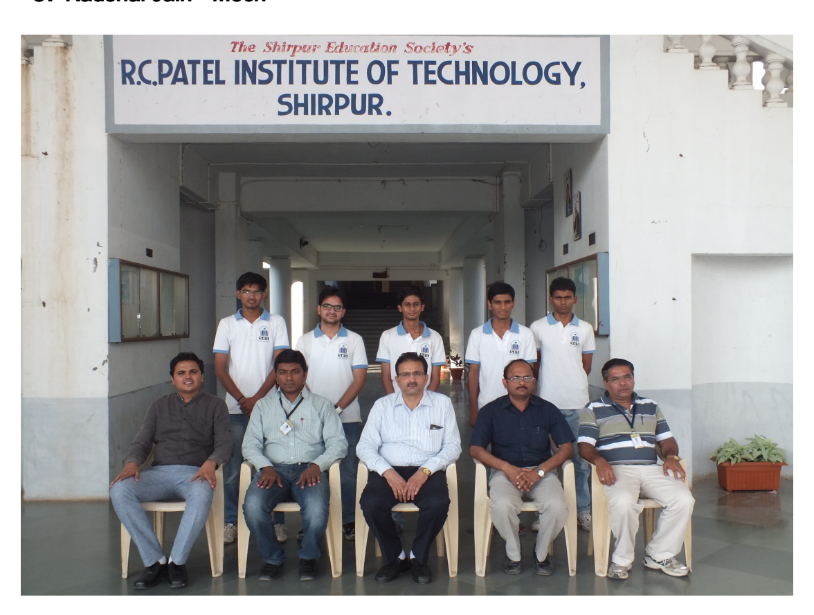
TCS Selected students 2013-14 Batch