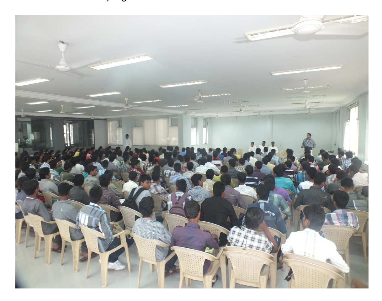
Faculties during the session with students

Foundation written & spoken English course for First year engineering students started from 22<sup>nd</sup> July 2013. This workshop is for 8 days and 2 hrs each of batch. Total enrolled students are 550 for this programme.