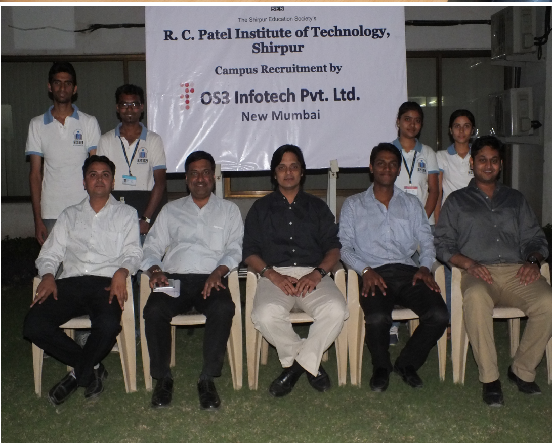
Team OS3 with selected students of RCPIT 2013-14