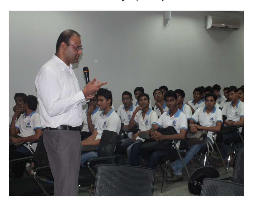
Trainer interacting with students