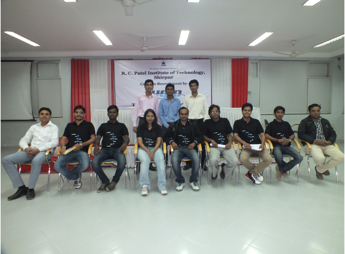
Tudip Technology Selected students 2013-14 Batch