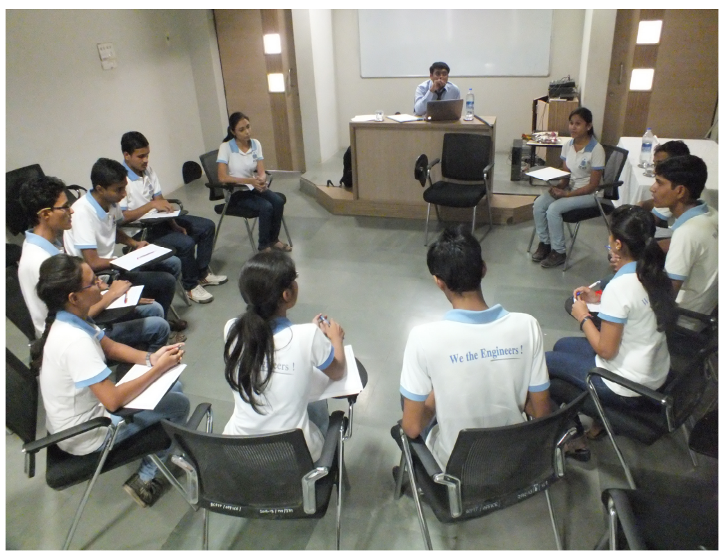
Softenger India Campus recruitment Process at RCPIT