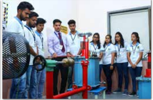
Modern Infrastructure & Facilities