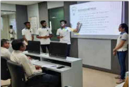
Smart India Hackathon