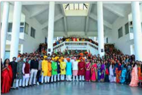
Celebrating Maharashtra Din and Kamgar Din